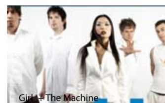
Girl + The Machine