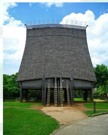
"Oblique Points of view" Exhibition is currently on display at the Vietnam Museum of Ethnology.

space. Special performance for private parties and events can be arranged.