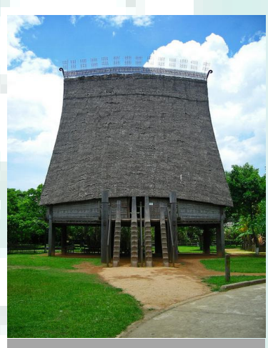
"Oblique Points of view" Exhibition is currently on display at the Vietnam Museum of Ethnology.

in the outdoor exhibition space. Special performance for private parties and events can be arranged.