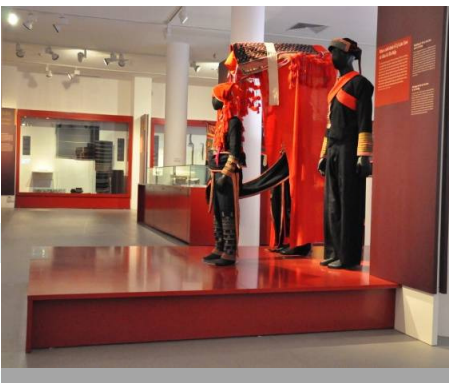
"Exploring Singapore, Colors of Heritage" Exhibition is currently on display at the Vietnamese Women's Museum.