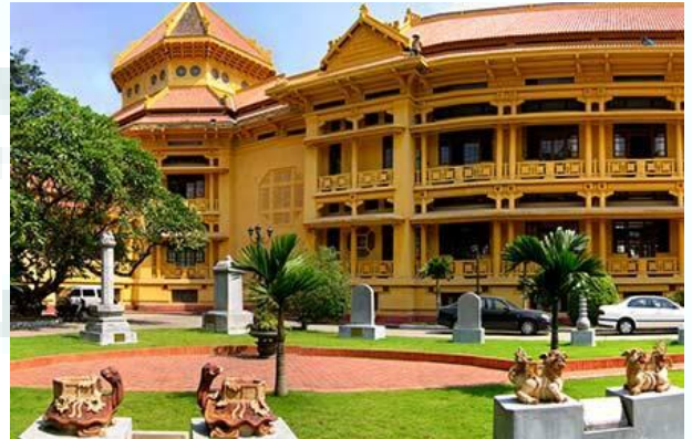
"Treasures of Tây Sơn" Exhibition is currently on display at the History Museum.

Video: 800,000 VND per day if showcases are opened; 400,000 VND per day if showcases are not opened Research photographs: 20,000-600,000 VND per day (depending on needs) Personal video: 30,000 VND Personal camera: 15,000 VND