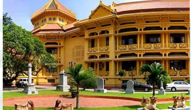
"Treasures of Tây Sơn" Exhibition is currently on display at the History Museum.

Video: 800,000 VND per day if showcases are opened; 400,000 VND per day if showcases are not opened Research photographs: 20,000-600,000 VND per day (depending on needs) Personal video: 30,000 VND Personal camera: 15,000 VND