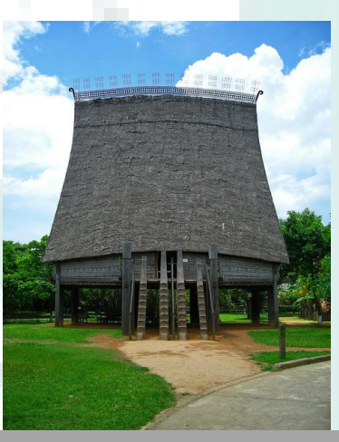
"Becoming a Man Ceremony of the Bamana in Mali" Exhibition is currently on display at the Vietnam Museum of Ethnology.

space. Special performance for private parties and events can be arranged.