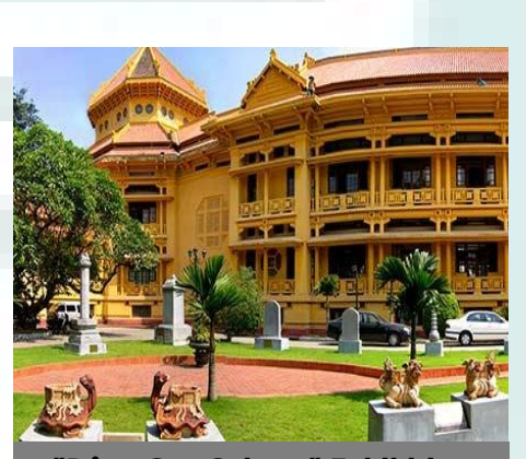
"Đông Sơn Culture" Exhibition

Personal video: 30,000 VND Personal camera: 15,000 VND